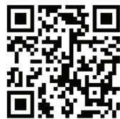
NetBenefits® Microsoft Surface™ app